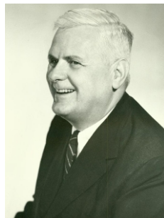
Alonzo Church (1903–1995)